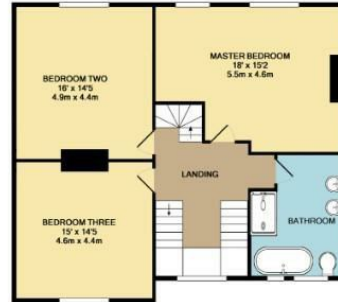
FIRST FLOOR APPROX. FLOOR AREA 827 SQ.FT. (77.3 SQ.M.)