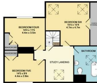
SECOND FLOOR APPROX. FLOOR AREA 820 SQ.FT. (76.1 SQ.M.)