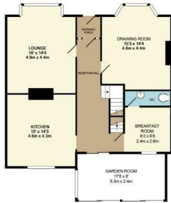
GROUND FLOOR APPROX. FLOOR AREA 1105 SQ.FT. (102.7 SQ.M.)