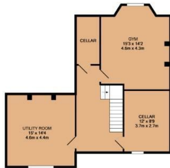
BASMENT LEVEL APPROX. FLOOR AREA 772 SQ.FT. (71.7 SQ.M.)